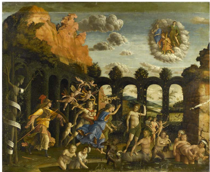
Minerva Banishing the Vices from the Garden of Virtue Department of Paintings, Musée du Louvre, Paris, inv. 371

+33 (0)1 40 20 54 44 coralie.james@louvre.fr