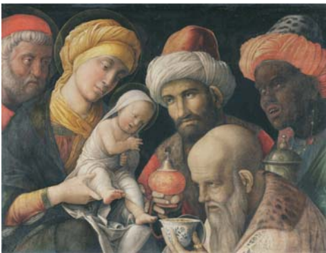
Adoration of the Magi Ca. 1495-1500. Canvas. H. 54.6; W. 70.7 cm Los Angeles, The J. Paul Getty Museum, inv. 85 PA 417

Beginning in 1504, near the end of his life, Mantegna worked on his own funerary chapel in the Basilica Sant’Andrea in Mantua, the most striking evidence of the social status attained by the artist. His renown had already earned him the admiration of Albrecht Dürer who, during a visit to Venice, set out to meet the master, but Mantegna died in Mantua on September 13, 1506, several days before Dürer’s arrival. The wave of appreciation for Mantegna’s work, already begun during his lifetime, only came to be further enhanced over the centuries, particularly in France. For instance, in 1499, the Cardinal Georges d’Amboise, archbishop of Rouen and a minister under Louis XII, saw Mantegna as “the world’s greatest painter” and had one of the artist’s Triumphs of Caesar copied onto the facade of his Norman château in Gaillon. The artist’s prestige continued into the 16th and 17th centuries—from the Fontainebleau School to Poussin and Stella—while in the 19th century Gustave Moreau and Degas were his champions and Proust was to sing his praises several times in Swann’s Way.