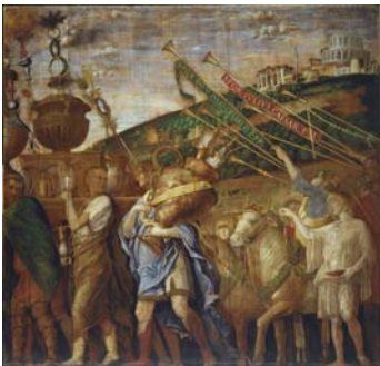
The Triumphs of Caesar: The Vase Bearers After 1490 and before 1506 Canvas. H. 2.66; W. 2.78 m Hampton Court, The Royal Collection