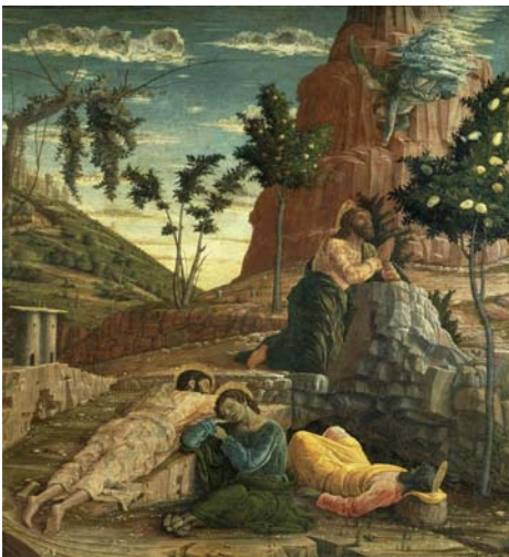
Prayer in the Garden (1457-1459, detail) Transferred from wood to canvas and then glued to wood. H. 71.1 cm; W. 93.7 cm. Musée des Beaux-Arts, Tours; inv. 803-1- 24

This exhibition is organized by the Louvre and the Réunion des musées nationaux.